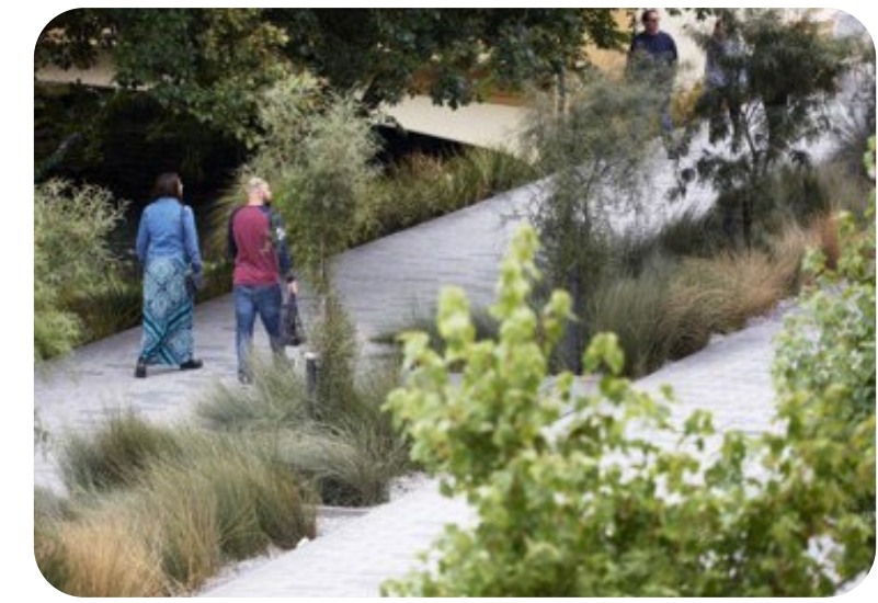
An urban realm that promotes active travel to access facilities