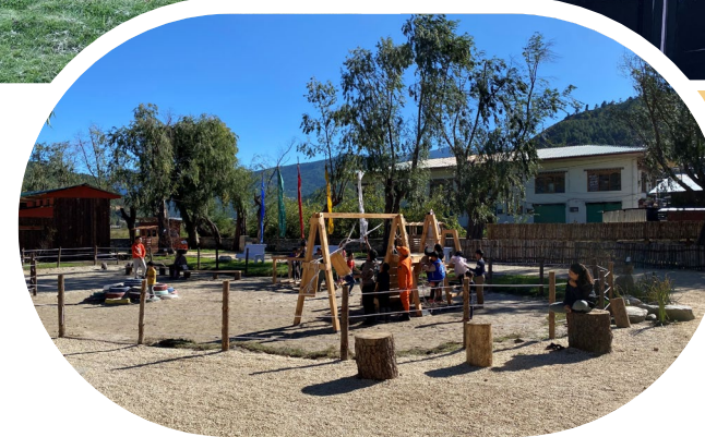
Existing facilities in Thimphu