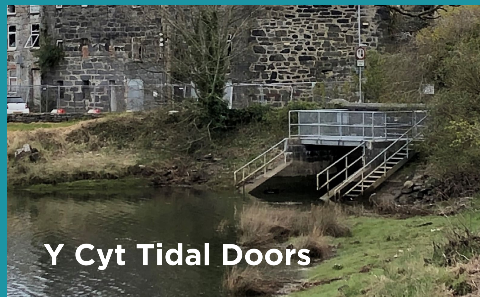
Y Cyt Tidal Doors