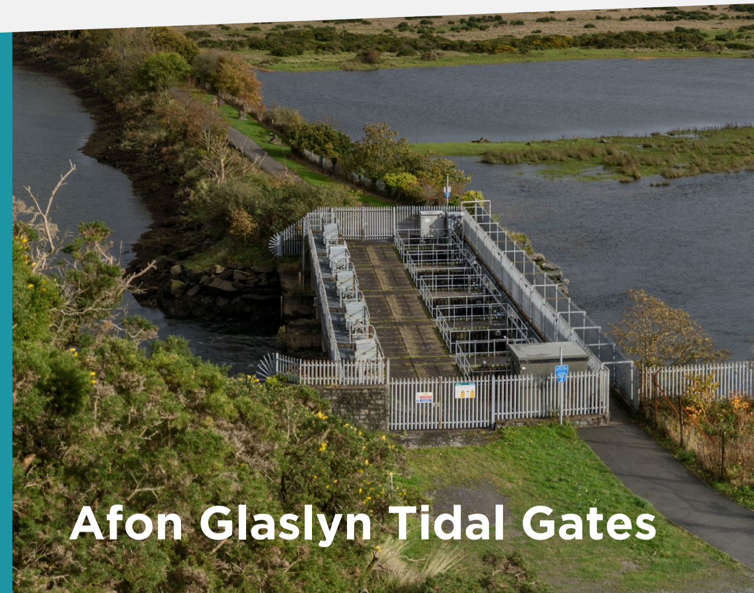
Afon Glaslyn Tidal Gates

Through this study, we are developing our understanding of the flood risk and the function of the defences so we can continue to protect homes and businesses in the long-term.