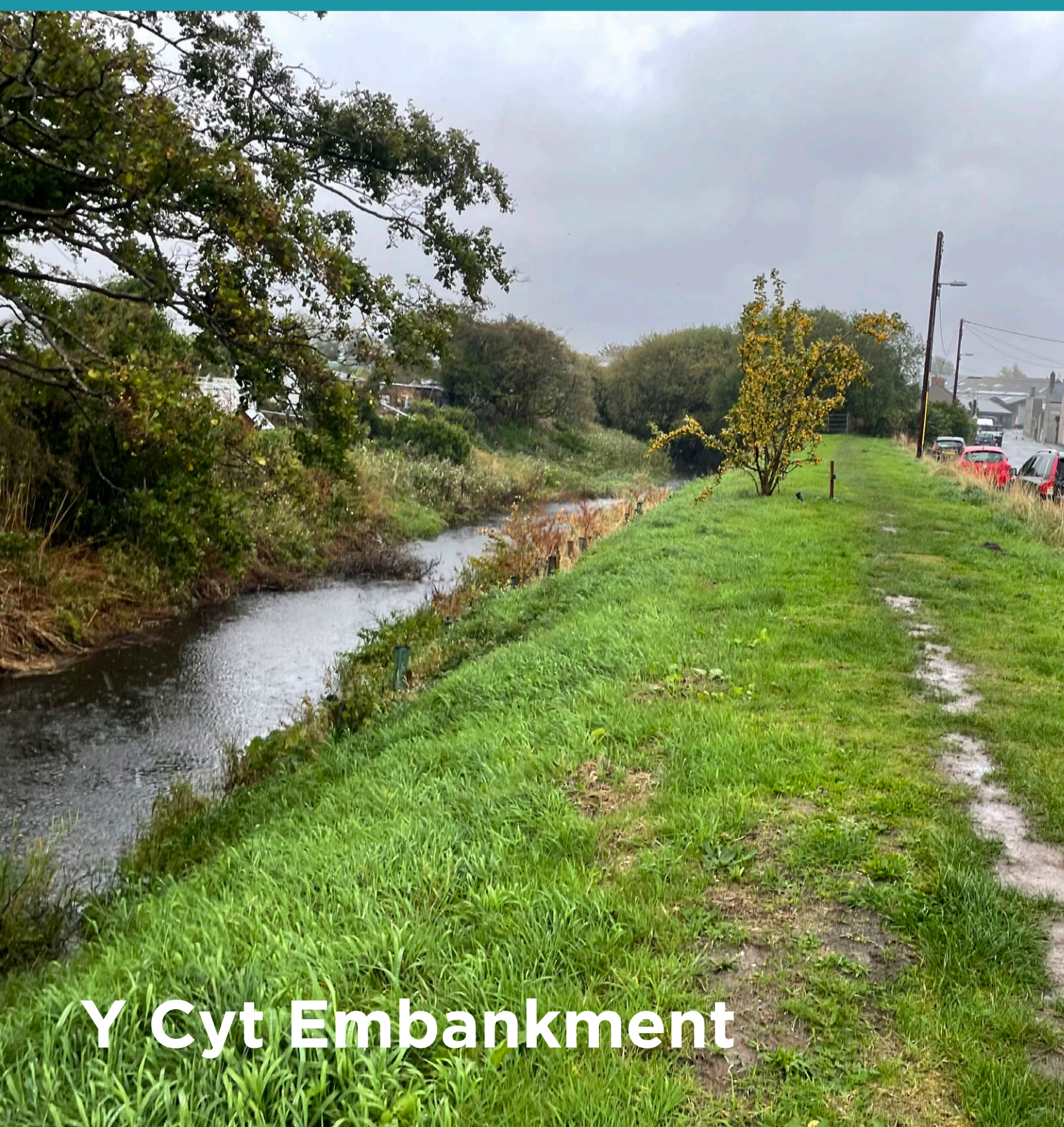
Y Cyt Embankment