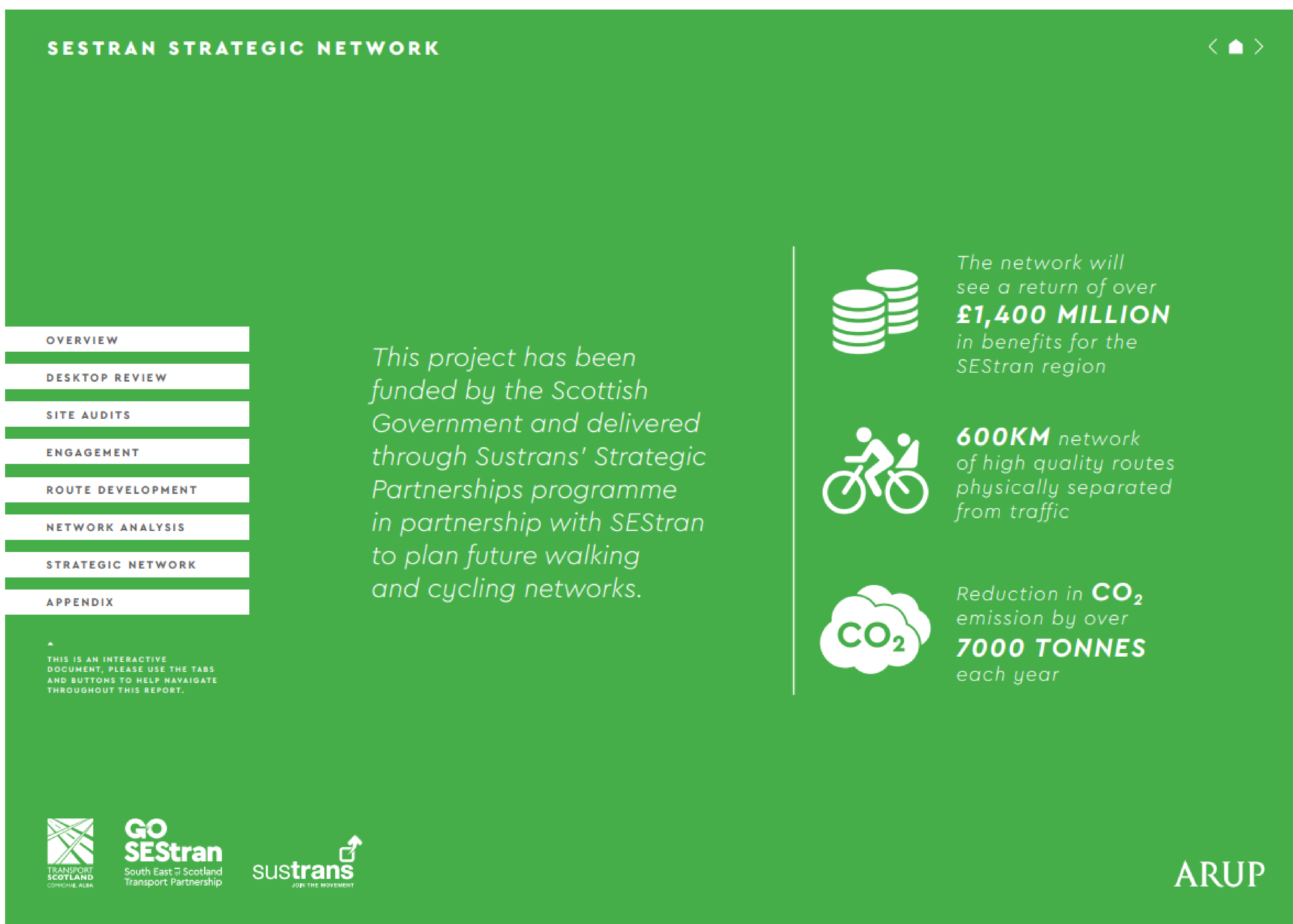
SEStran Strategic Network Study 2020

Delivery of this network will provide significant new opportunities for enabling walking, cycling and wheeling and in particular cross boundary trips and links to public transport hubs.